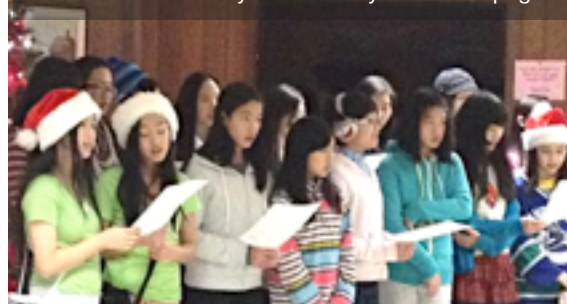
EDGe youths gladly went Christmas carolling at a senior home this past Christmas.

6 Missed a Sunday? Previous sermons are available for download from our site. You can also sign up for email updates.