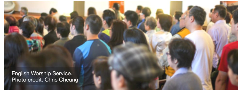
English Worship Service.